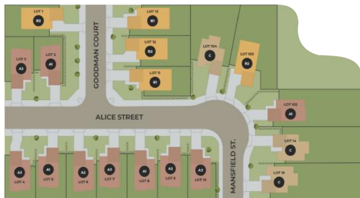
Site Plan Legend